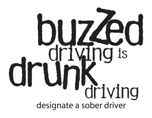
Figure 1: NHTSA's "Drive Sober or Get Pulled Over" and "Buzzed Driving is Drunk Driving" Campaigns

Officials in four states said that there is a lack of focus on drug impairment in highway-safety public-education campaigns. For example, the traffic-safety-marketing communications resources available on NHTSA's website for states, partner organizations, and highway safety professionals who are related to impaired driving are generally focused on reducing drunk driving: "Drive Sober or Get Pulled Over" and "Buzzed Driving is Drunk Driving." See figure 1. Additionally, campaigns in the states we selected generally use language that may suggest a focus on impairment due to alcohol, rather than drugs, for example, "Drive Hammered, Get Nailed."