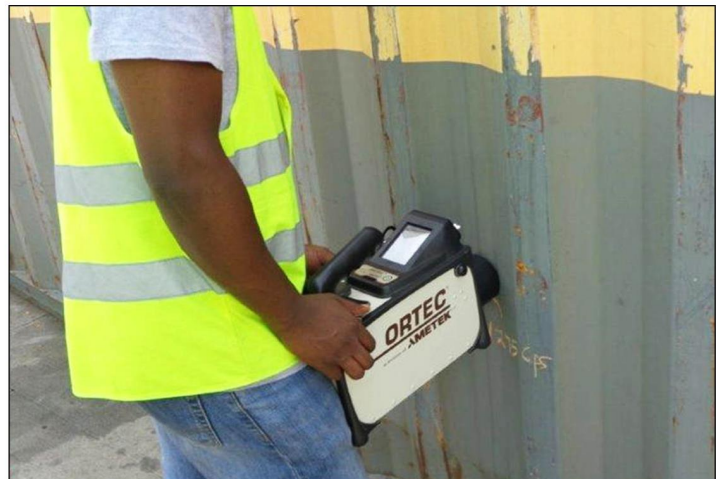
Upper left: Radiation portal monitors at a land border crossing. Upper right: Radiation portal monitors at a small seaport. Lower left: Mobile detection system van along a road. Lower right: Handheld radiation detection device.

Source: Nuclear Smuggling Detection and Deterrence program (photos). | GAO-16-460