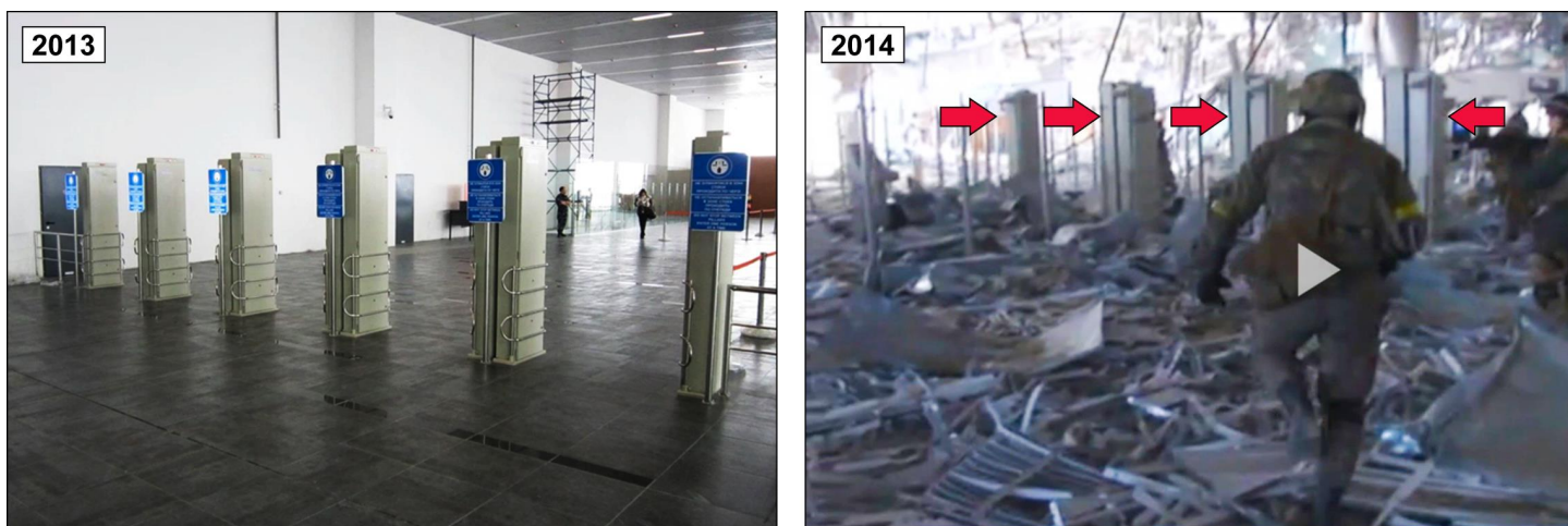
Figure 3: Before and After Images Illustrating Damage Caused by Fighting in Ukraine to Site with Installed Radiation Portal Monitors

The image on the left shows a site located in eastern Ukraine after the Nuclear Smuggling Detection and Deterrence (NSDD) program completed installation of the radiation portal monitors (RPM) in 2013. The image on the right shows damage caused to the same site as a result of heavy fighting in 2014. The arrows indicate the location of the still-standing RPMs amidst the rubble.