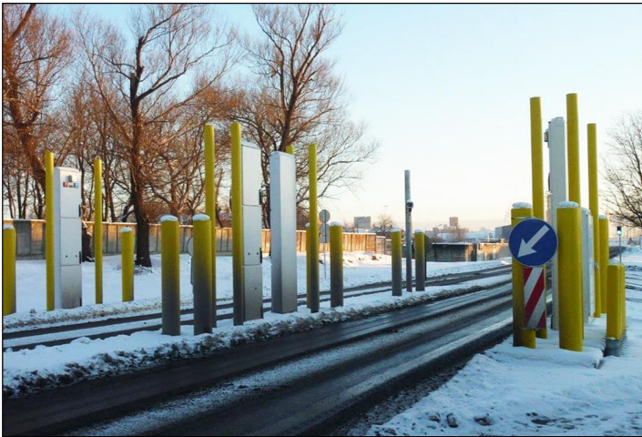
Figure 1: Examples of Radiation Detection Equipment Provided by the Nuclear Smuggling Detection and Deterrence Program