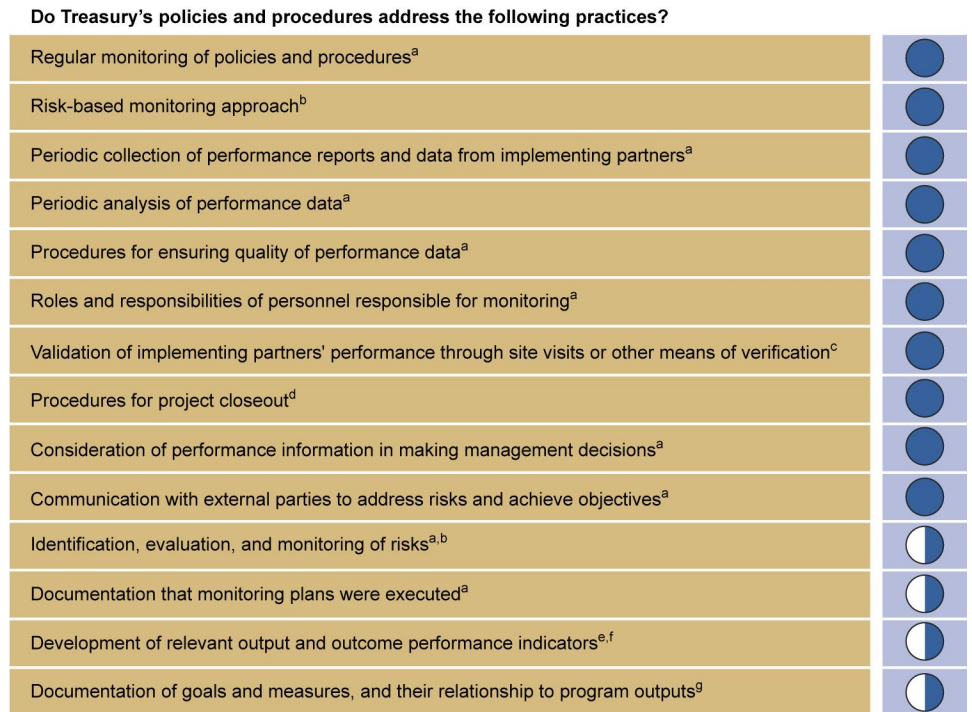
Figure 2: Comparison of the Department of the Treasury’s Current Monitoring Framework with Leading Practices

validation of performance through site visits. 15 However, Treasury’s assessment of HFAs’ internal control programs, development of performance indicators, documentation of goals and measures, and documentation of HFAs’ monitoring could better address leading practices (see fig. 2).