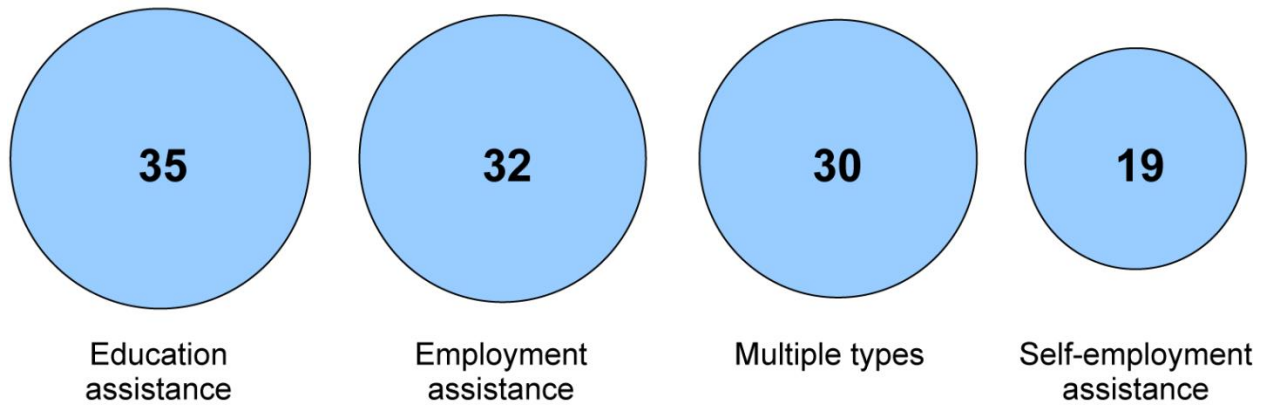
Figure 3: Number of Federal Programs Whose Primary Purpose Is to Provide Education, Employment, or Self-Employment Assistance to Servicemembers, Veterans, or Their Families, by Type of Service Provided

Source: GAO analysis of survey data. | GAO-19-97R