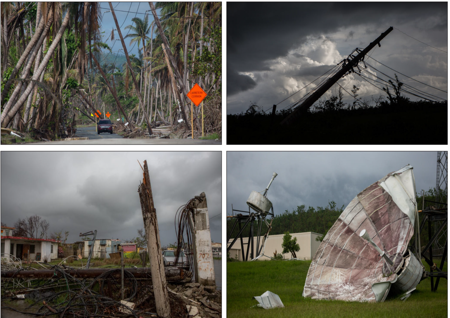
Figure 2: Damaged Power Lines and Satellite Dish in Puerto Rico after Hurricane Maria in November 2017

Source: Federal Emergency Management Agency. | GAO-18-472