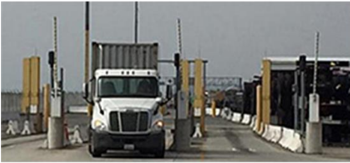
Figure 1: Management of Federal Technology and Science Programs

Management of Federal Technology and Science Programs – GAO also assess the management and coordination of federal research and development efforts, including investments in scientific facilities (such as telescopes and research vessels) and emerging technologies (like synthetic biology and quantum computing).