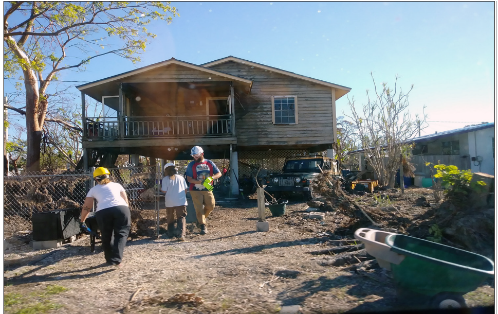
Figure 3: Nonprofit Volunteer Team Clearing Debris in Big Pine Key, Florida after Hurricane Irma

In regard to ongoing work, we are evaluating disaster recovery programs for individuals and those with disabilities, efforts to strengthen disaster resilience and better prepare for future disasters, and efforts to restore the power grid in Puerto Rico, among other issues. Given the number of ongoing engagements and our reporting schedule, we anticipate that GAO will use all of the $14 million in disaster funds by the end of FY 2020. A complete list of the reports issued and audits currently underway is included as Enclosure II.