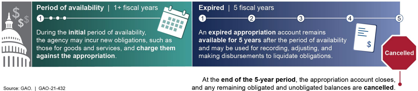
Figure 1: Time-Limited Appropriations Are Cancelled at the End of the Expired Phase

An expired appropriation account generally remains available for 5 years, during which time the agency may use it to record, adjust, and make disbursements to liquidate obligations that were properly chargeable to the account. As shown in figure 1, a time-limited appropriation account closes at the end of the 5-year period, unless an exception is made in law, and any remaining obligated and unobligated balances are cancelled. The closed appropriation account may not be used for obligation or expenditure for any purpose.