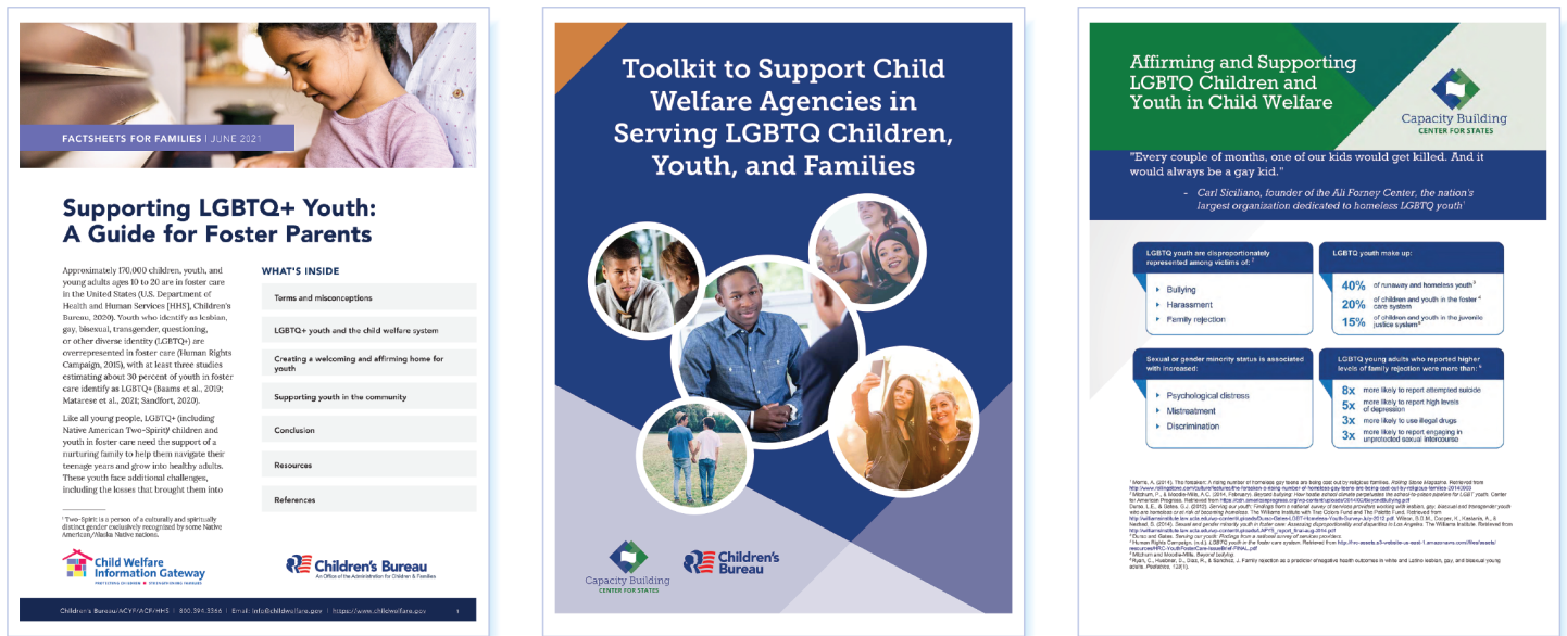
Figure 2: Examples of Administration for Children and Families Publications Related to Working with Lesbian, Gay, Bisexual, Transgender, and Queer or Questioning (LGBTQ+) Youth and Families

youth. 74 The 2022 memorandum addressed some challenges facing these youth. For example, it urged child welfare agencies to consider youth’s SOGIE to ensure that youth have access to developmentally appropriate activities, such as SOGIE-based affinity groups within their schools.