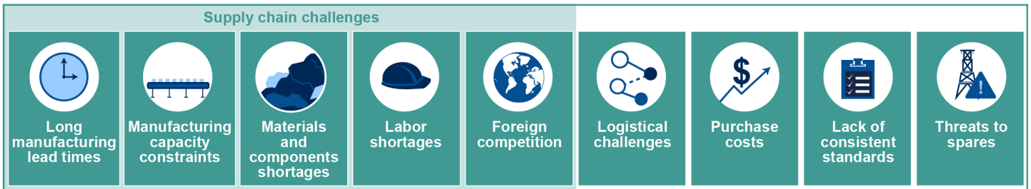
Figure 2. Challenges for Electric Utilities Attempting to Ensure Adequate Reserves of Transformers