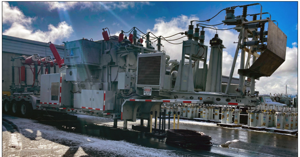
Figure 3. Example of a Mobile Substation

Given the challenges above, managing a limited inventory that may not meet demand for every utility would require decisions about who receives a transformer in an incident where multiple utilities suffer losses. However, smaller utilities we spoke with suggested that a strategic federal reserve of mobile substations—which include transformers—could provide a temporary stopgap while utilities acquired permanent replacements (see fig. 3 below for an example). Some of these officials told us that establishing a federal inventory of mobile substations would still face some of the challenges described above, depending on its configuration. Furthermore, utility officials described other ways the federal government could ensure adequate transformer reserves. For example, some officials suggested that federal entities, such as the power marketing administrations, could securely store privately owned spares on their property. Others suggested that the federal government could survey utilities to develop and share a comprehensive list of available spares nationwide.