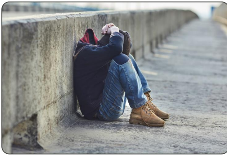
Figure 2: Underserved Populations of Child Trafficking Survivors Identified by Selected Stakeholders