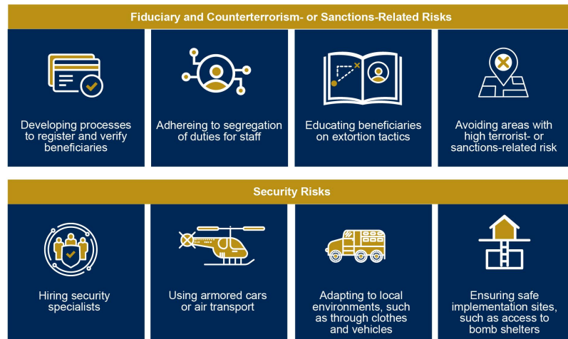
Figure 2: Examples of USAID Implementing Partners' Controls to Manage Fiduciary, Counterterrorism- or Sanctions-Related, and Security Risks in Nigeria, Somalia, and Ukraine

Source: GAO analysis of interviews with U.S. Agency for International Development (USAID) implementing partners; nexusby/stock.adobe.com, chocostar/stock.adobe.com, GAO (toons) | GAO-24-106192