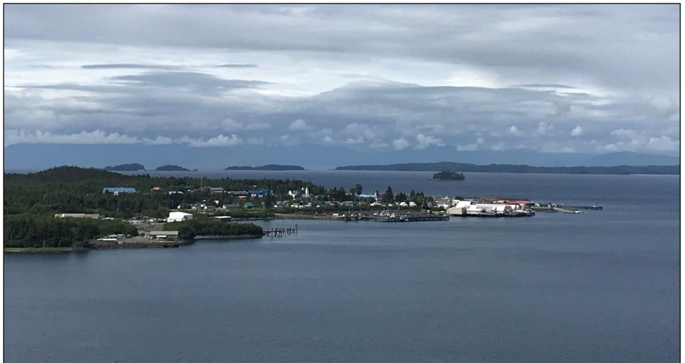
Figure 5: Metlakatla Indian Community, Which Received a $10.5 Million Tribal Broadband Connectivity Program Grant

Metlakatla Indian Community's project involves installing a submarine fiber connection to Ketchikan, Alaska, and a last-mile fiber broadband network to serve the community. The environmental review process for this project resulted in a finding of no significant impact.