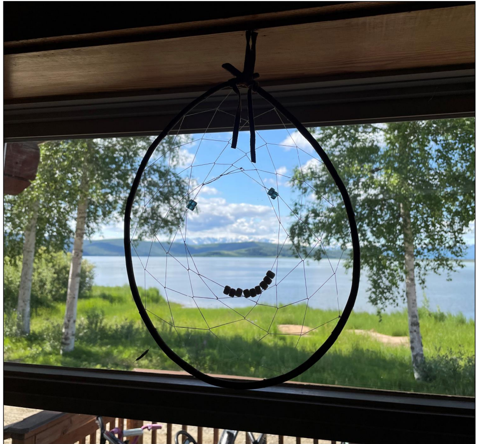
Figure 3: Remote Location to Receive Broadband, Healy Lake Village, Alaska

The Community Center in Healy Lake Village, Alaska, accessible only by boat and air, that would be served by a Tribal Broadband Connectivity Program grant