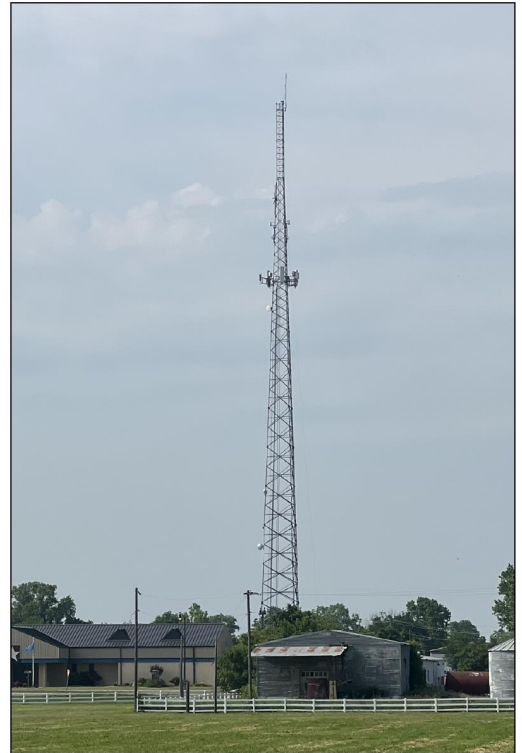
Wireless telecommunications equipment owned by Chickasaw Nation in Ada, Oklahoma