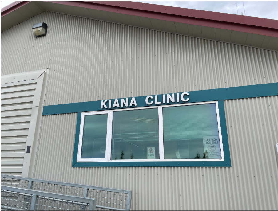
Figure 4: Clinic and Medical Equipment in the Native Village of Kiana, Alaska