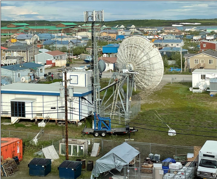
Wireless telecommunications equipment in Kotzebue, Alaska