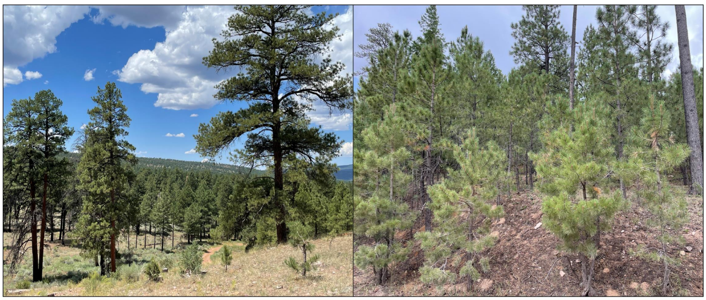
The photo on the left shows a treated area that was thinned and burned to reduce the density of trees. The photo on the right shows an adjacent untreated site with a higher density of trees with branches extending to the ground—conditions that can contribute to higher-intensity wildfires.