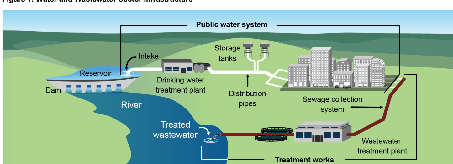
Figure 1: Water and Wastewater Sector Infrastructure

Sources: U.S. Environmental Protection Agency and Department of Homeland Security (information); GAO (graphic). | GAO-24-106744