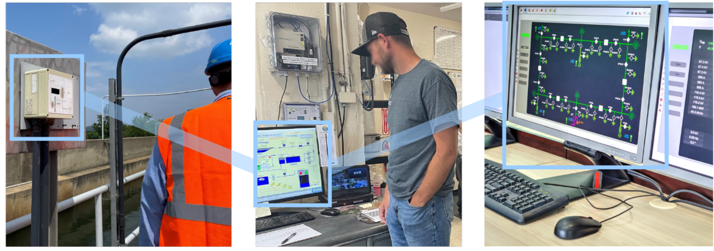
Figure 3: Example of Monitoring Hardware and a Supervisory Control and Data Acquisition (SCADA) System Display in a Water Treatment Facility Control Room

SCADA systems are made of hardware and software components working together to collect, translate, and display data. When abnormal conditions occur within a water treatment process, SCADA systems can trigger alarms to notify operators that something is wrong. SCADA may use wired or wireless technologies to transmit data between machines and operators.