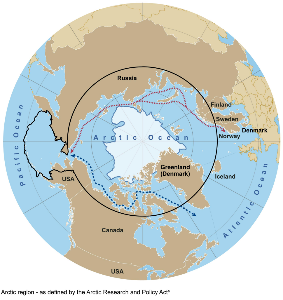
Figure 2: Map of the Arctic Region with Potential Sea Routes and Lowest Extent of Sea Ice in 2023