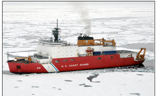
Figure 1: The Coast Guard's Polar Icebreakers, the Healy and Polar Star

The Coast Guard has two operational polar icebreakers (see fig. 1). In the Arctic, the Healy , a medium polar icebreaker, is the only Coast Guard icebreaker primarily designated to support scientific research missions. In the Antarctic, the Polar Star , a heavy polar icebreaker, contributes to a multi-agency effort to support the National Science Foundation's presence at the McMurdo Station research facility. It does so by breaking ice to allow cargo ships and fuel tankers access during the Antarctic summer.