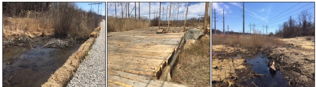
Access road in a wetland for a transmission line project