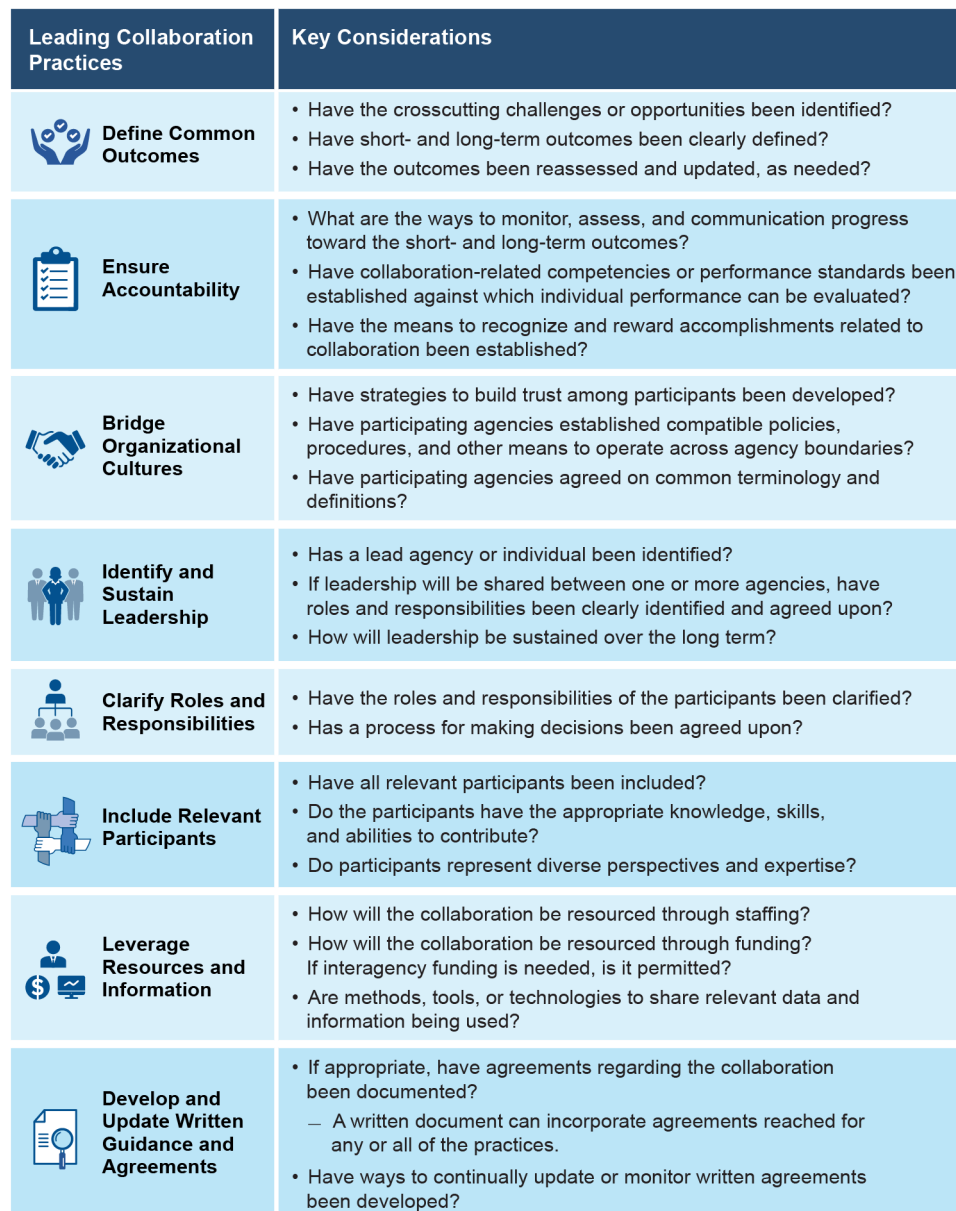
Figure 3: GAO's Leading Interagency Collaboration Practices and Key Considerations

GAO-25-107020