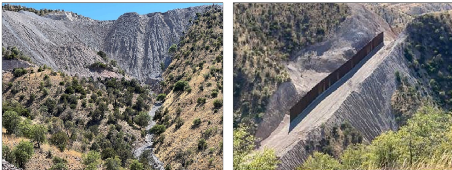
Erosion below the site of a cleared staging area (left); erosion below an area where only several border barrier panels were installed as of January 2021 (right).