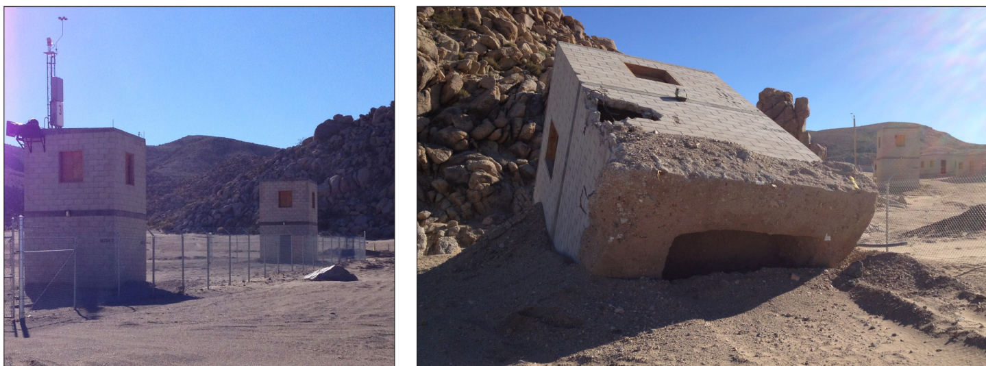
Figure 9: Army Training Area in Southwestern United States