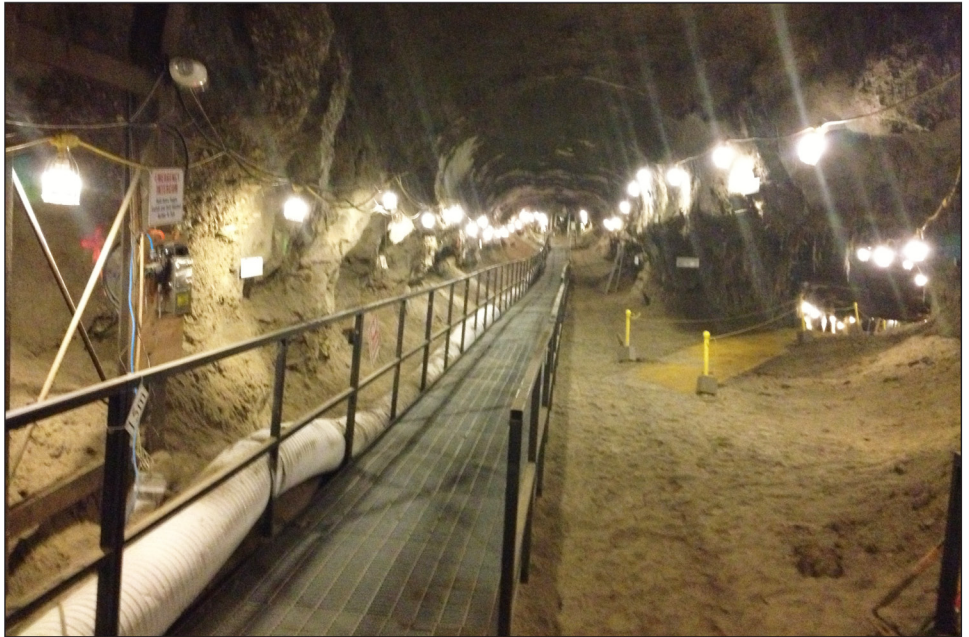
Figure 10: Permafrost Tunnel Research Facility