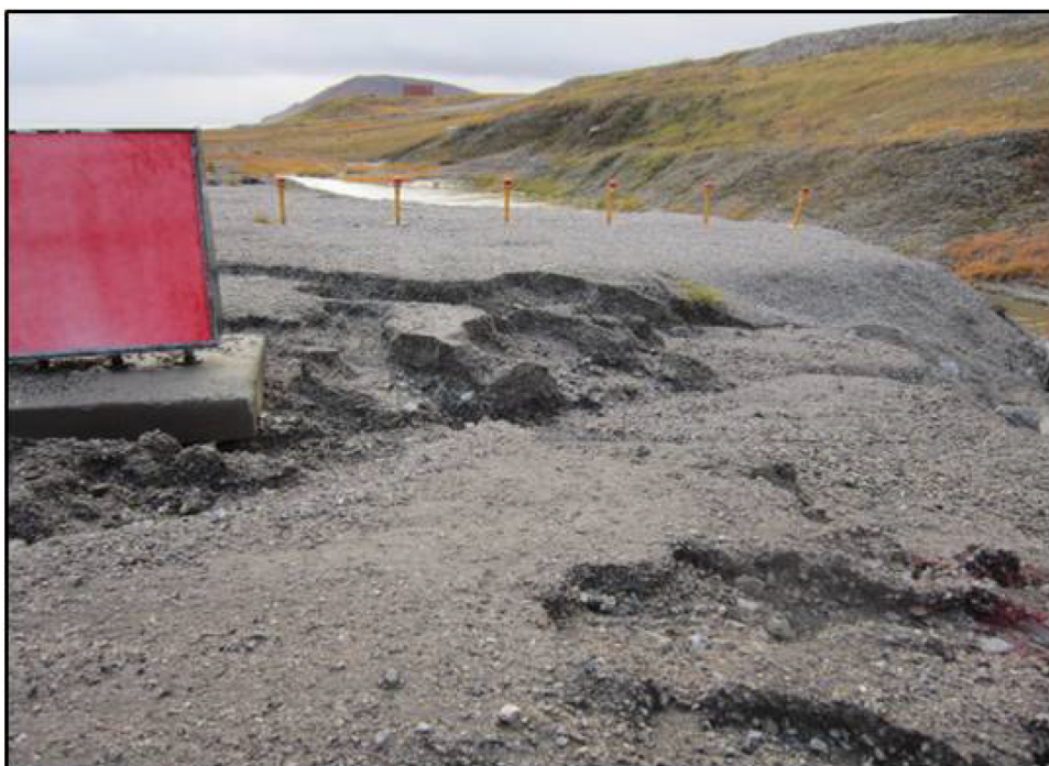
Figure 1: Overrun area of Air Force runway impacted by erosion

functional. This means that access to the radar installation is limited. At another radar early warning installation, increased erosion has damaged a seawall, allowing increasingly large waves to damage the overrun area of a runway 23 (see fig. 1). According to installation officials, daily operations at these types of remote radar installations are at risk due to potential loss of runways, and such installations located close to the coastline could be at risk of radar failure if erosion of the coastline continues. Air Force headquarters officials noted that if one or more of these sites is not operational, there is a risk that the DOD early warning system will operate with diminished functionality. However, the system is designed to operate with the loss of one or more sites, as other sites can back up those lost.