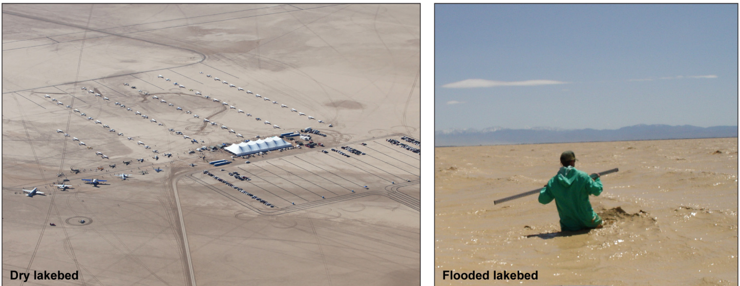
Figure 4: Dry lakebed runway in the Southwestern United States under normal and flood conditions

temporary or prolonged disruption of military operations, as described by DOD in the Roadmap. For example, officials at an installation located in the desert Southwest explained that flash flooding due to an intense rain event had made one of their emergency runways unusable. According to these officials, it took about 8 months for the flooding to subside. During that time, aircraft performing training and testing missions could not use the emergency runway (see fig. 4). Although intense rain events such as the one mentioned above occur periodically in the desert Southwest, DOD recognizes in its Roadmap that increases in heavy downpours are projected to increase as a result of climate change.