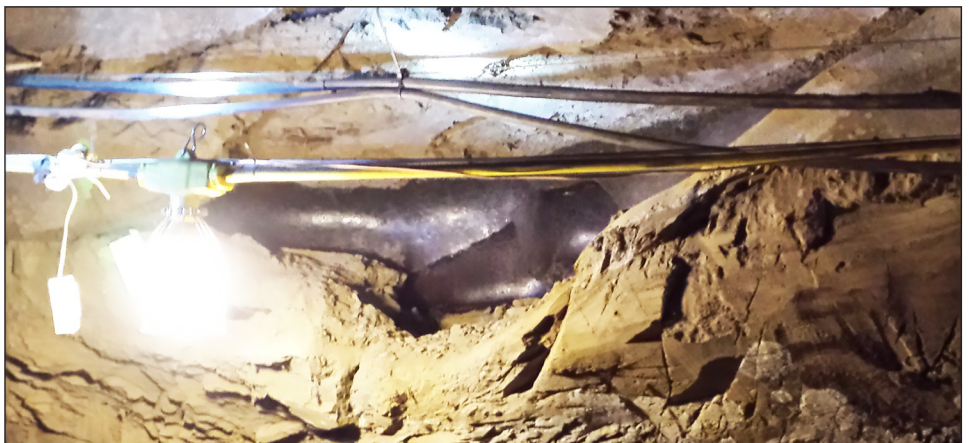
Figure 11: Ice Embedded in Soil

Note: Officials stated that research being conducted at the Permafrost Tunnel Research Facility will provide DOD and installation planners with information on how thawing permafrost can impact installations and how to adapt to potential impacts. The tunnel is approximately 15 meters below the surface and is 110 meters long.