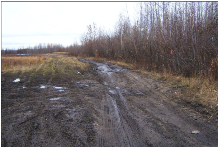
Figure 6: Road Leading to Training Area in Alaska

More frequent and more severe extreme weather events and associated impacts may result in increased fiscal exposure for DOD. During our site visits, installation officials identified costs—when known—that are associated with potential impacts to infrastructure identified by DOD in its Roadmap. These costs are associated with both relatively common types of infrastructure and unique facilities. According to our discussions with officials, there is a cost to rehabilitate common types of infrastructure, such as runways and target equipment. For example, officials explained that when coastal erosion shortened a radar site’s runway, DOD personnel had to access the site by helicopter, instead of the planes that personnel could have used with a full-length runway. This resulted in increased costs for DOD because reaching the site by helicopter is more expensive, according to officials. In another example, when an increase in the amount of freezing rain resulted in an increased requirement for maintenance of target equipment, officials reported an added expense of target repair. Further, there are costs associated with roads and open fields impacted by thawing permafrost. For instance, officials estimate the cost to repair two gravel roads (see fig. 6) and fill holes in one drop zone to be more than $500,000. According to officials, if these types of impacts increase in frequency or severity due to climate change, DOD’s routine maintenance costs are likely to increase.