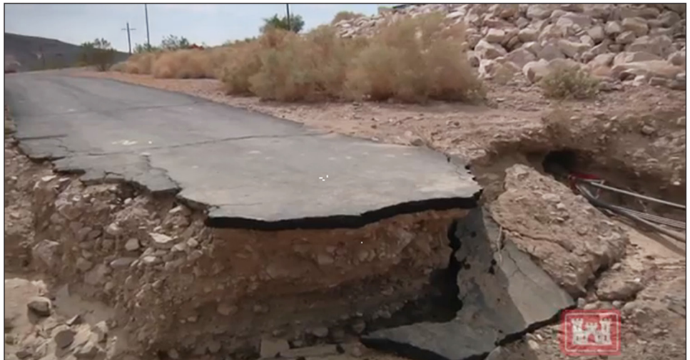
Figure 8: Video Still Showing Damage to Infrastructure at Installation located in Southwestern United States