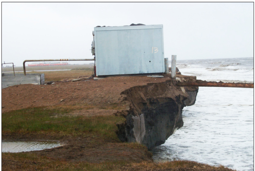
Figure 7: Coastal Erosion near DOD Early Warning Site

Officials also provided examples of costs associated with climate change impacts at unique DOD facilities. For example, officials from a Navy shipyard we visited stated that the catastrophic damage that could result from the flooding of a submarine in dry dock could cause substantial repair costs. Another example is associated with an increase in coastal erosion due to the combination of thawing permafrost, decreasing sea ice, and rising sea levels in Alaska that has damaged several types of infrastructure located near coastal radar early warning and communication facilities (see fig. 7). For instance, officials stated that due to the operational risk posed by further degradation of one facility's seawall and runway, officials are planning a project to harden the seawall and protect the runway, which they estimate will cost approximately $25 million. The erosion has also damaged landfills located near these facilities. As a consequence, landfill content—such as trash—was falling into coastal waters. These officials estimate that the cost of completing environmental restoration of six coastal sites has been $32 million thus far and more funding may be required to relocate and restore other sites.