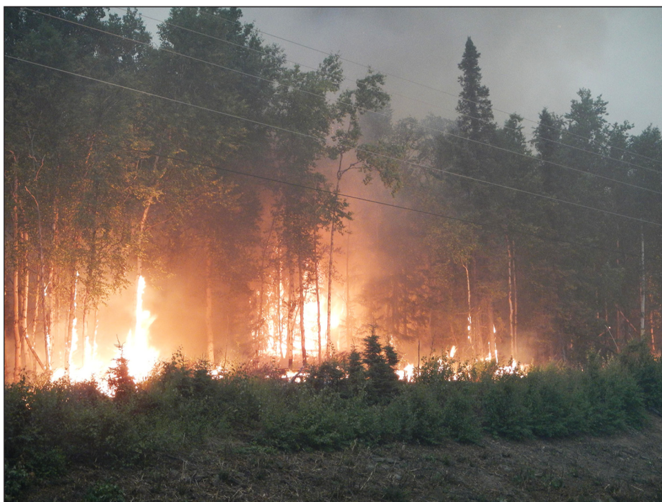
Figure 3: Wildfire on a training range in Alaska

Further, at an Army training area, officials told us drought contributed to wildfires in 2013 and that units that had planned to train in the area experienced several mission impacts (see fig. 3). Officials told us that they had to postpone training from June 2013 to September or October 2013, and that the fires' smoke limited units' use of certain weapons systems in training. For example, there was no live-fire training allowed in one training area for 2 months. In addition, there was a decrease in the realism of training conducted. For instance, during an exercise that coincided with the fires, an official explained that aircraft could not deliver ordnance. The fires also affected landing conditions, forcing aircraft to save fuel, and thus reducing the amount of tactical training they were able to conduct.