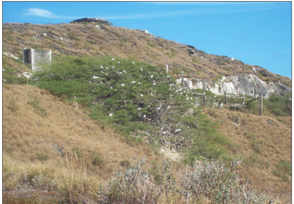
Figure 2: Training Range in the Pacific

At 9 out of 15 locations we visited or contacted, officials stated that they had observed changes in precipitation patterns and associated potential impacts. For example, officials at an installation in the Pacific told us that in 2008 they experienced 43 straight days of rain that resulted in mud slides and flooding that damaged base infrastructure, including base housing. By contrast, officials provided examples of impacts from reduced precipitation—such as drought and wildfire risk—and identified potential mission vulnerabilities—such as reduced live-fire training—as described by DOD in the Roadmap. For instance, officials also told us that for the last 3 to 4 years, there has been a continuous drought at another nearby installation, which has led to an increased number of wildfires in the area. As a result of a 2012 wildfire, officials were unable to access or move ammunition at that installation for 4 days. At a third installation in the same area, officials explained that these drought conditions—and the threat of wildfire—have limited the types of ammunition that can be used on certain training ranges (see fig. 2). As a result, units have had to spend extra time and money to travel to other installations to complete their required training.