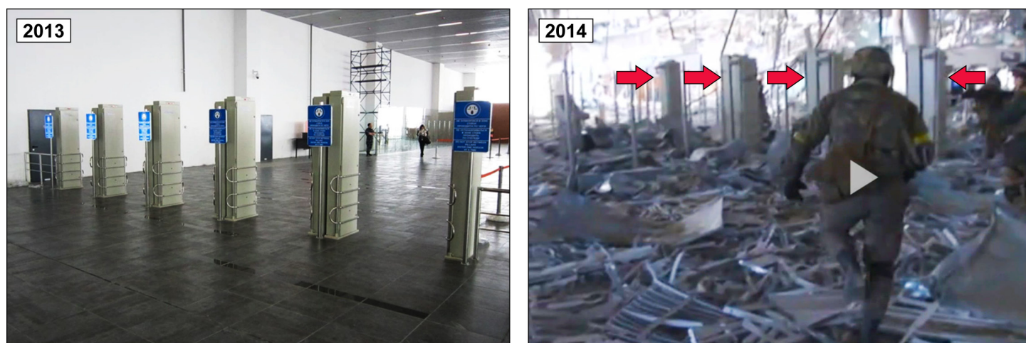
Figure 3: Before and After Images Illustrating Damage Caused by Fighting in Ukraine to Site with Installed Radiation Portal Monitors

The image on the left shows a site located in eastern Ukraine after the Nuclear Smuggling Detection and Deterrence (NSDD) program completed installation of the radiation portal monitors (RPM) in 2013. The image on the right shows damage caused to the same site as a result of heavy fighting in 2014. The arrows indicate the location of the still-standing RPMs amidst the rubble.