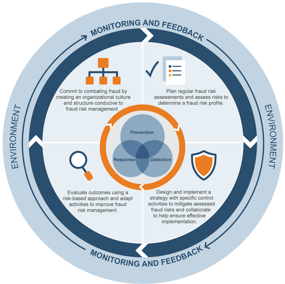
Figure 2: The Fraud Risk Framework