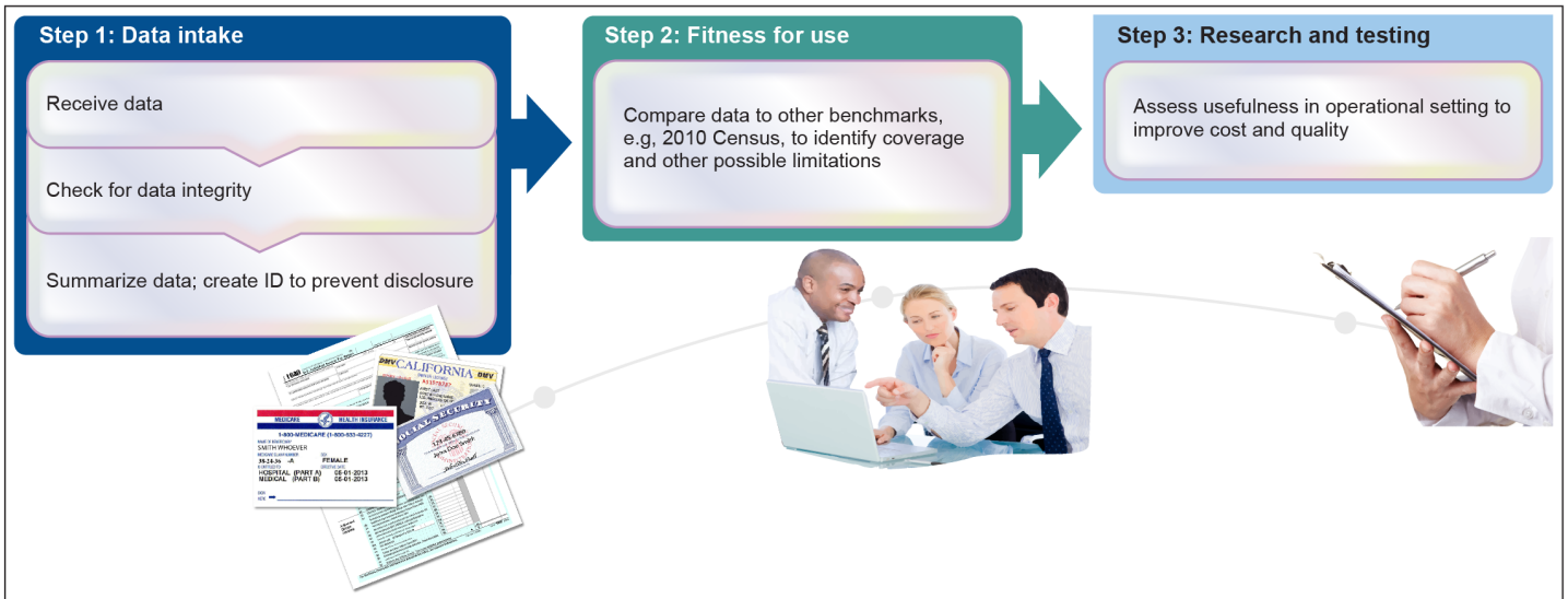
Figure 1: Census Bureau Implements Quality Assurance Steps before Using Administrative Records

GAO-17-664