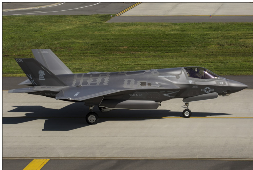
Figure 1: F-35B at Marine Corps Air Station Iwakuni, Japan

GAO-18-464R