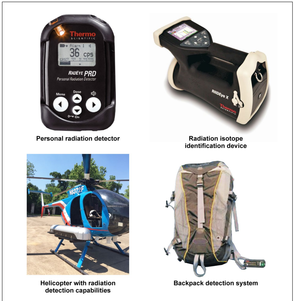
Figure 2: Photos of Types of Nuclear and Radiological Detection Equipment

Sources: Department of Homeland Security (top left, top right, and lower right photos); GAO (lower left photo). | GAO-19-327