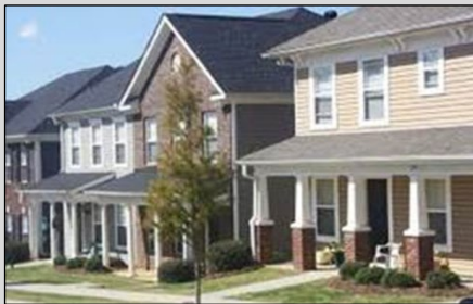
GAO-19-543

EPA provided a $20,000 environmental justice grant to a community organization in Spartanburg, South Carolina, in 2000 to support three research projects on the health of residents and former employees at a fertilizer plant and landfill sites. The target area, on the south side of Spartanburg, had a 96 percent African-American population according to EPA's 2002 IWG Status Report . EPA's initial $20,000 grant paid for research to help confirm health issues related to nearby hazardous waste sites. According to EPA officials, this initial investment has helped Spartanburg secure investments in the community. As a result, Spartanburg now has community health centers, affordable housing, and a recreation center.