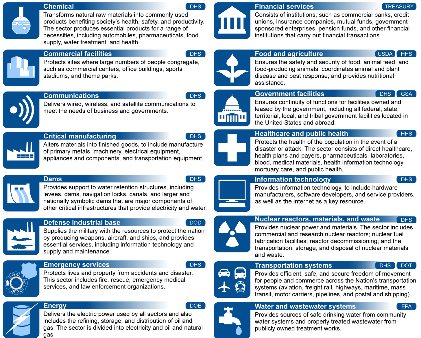
Figure 1: Critical Infrastructure Sectors and Related Sector-Specific Agencies