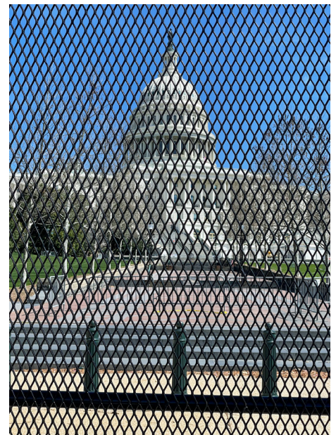
FIGURE 1: U.S. CAPITOL BEHIND SECURITY FENCING IN APRIL 2021

GAO-21-105255