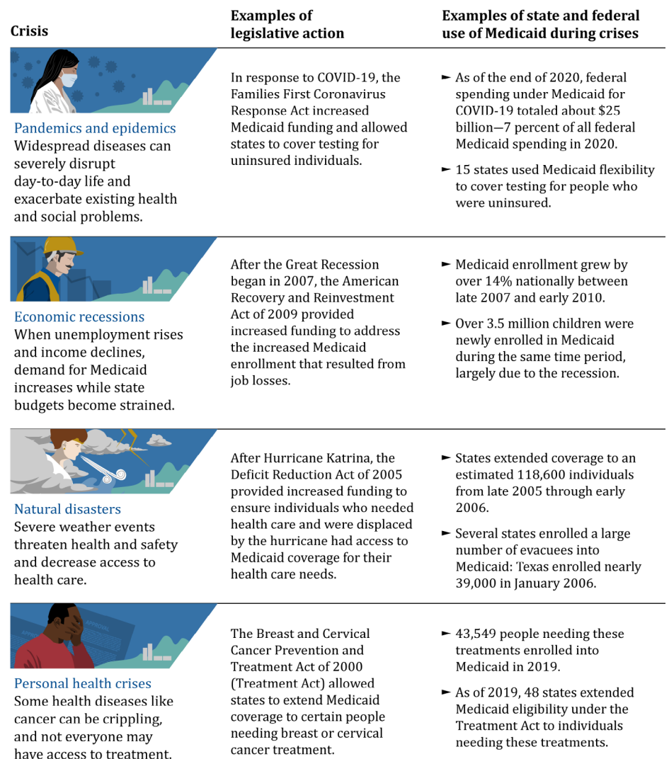
Figure 1: Examples of State and Federal Use of Medicaid during Times of Crisis

This capsule pulls from a number of GAO reports to examine how the federal government and states have used Medicaid in times of crises.