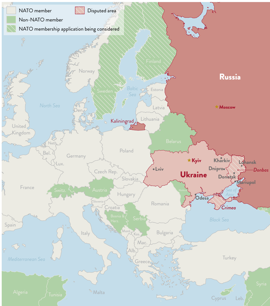
Figure 1: Map of Europe, October 2021–July 2022

Source: GAO analysis of Departments of Defense and State, Congressional Research Service, and NATO information; Map Resources (map). | GAO-22-106079