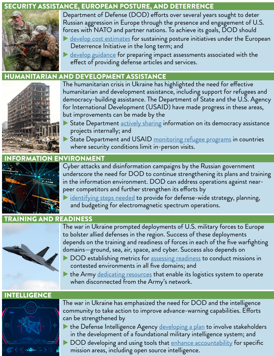
Figure 2: Selected National Security Considerations and Relevant GAO Recommendations, September 2022

Source: GAO (information). | GAO-22-106079