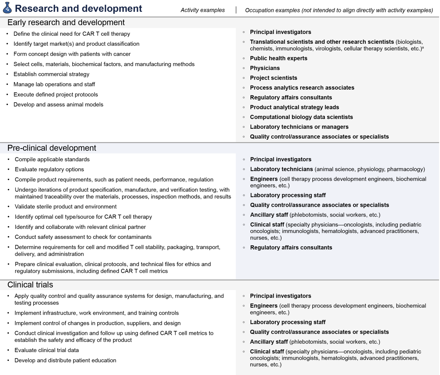
Figure 2: Activities and Occupations for Chimeric Antigen Receptor (CAR) T Cell Therapy by Occupation Category