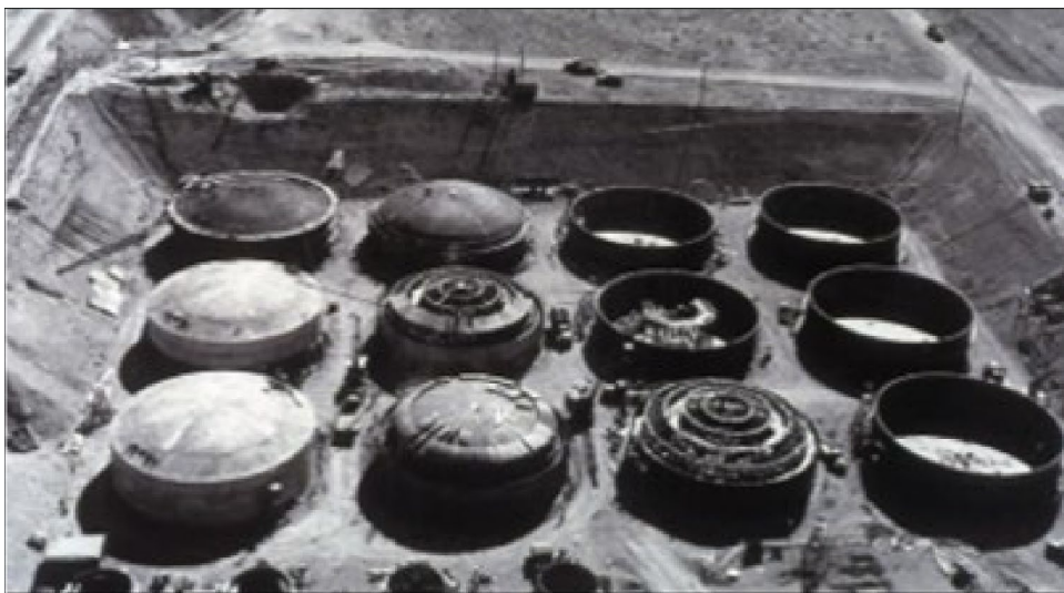
Figure 1: Hanford Single-Shell Tank Farm under Construction

Source: Department of Energy. | GAO-23-106151