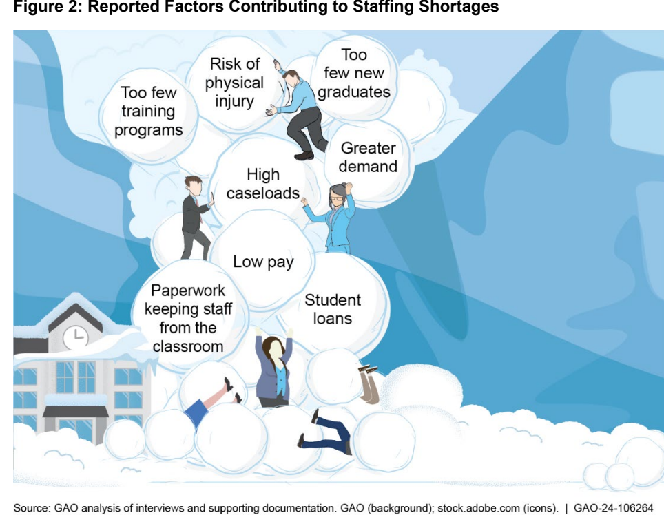
Figure 2: Reported Factors Contributing to Staffing Shortages

Officials from Most Districts Also Identified Insufficient Time for Professional Development, Communication Challenges with Parents, and Insufficient Collaboration as Obstacles