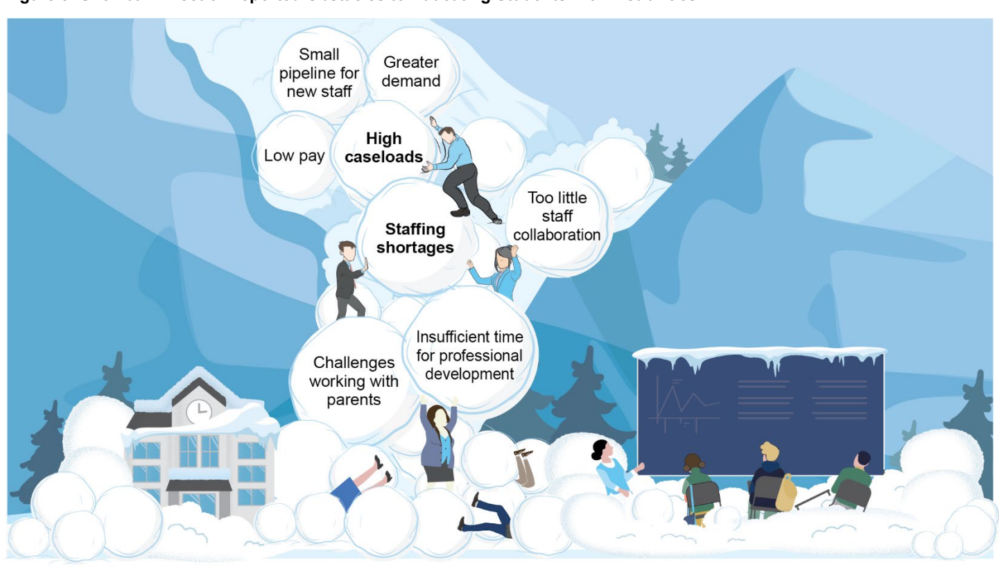
Figure 3: Snowball Effect of Reported Obstacles to Educating Students with Disabilities

Source: GAO analysis of interviews and supporting documentation. GAO (background); stock.adobe.com (icons). | GAO-24-106264