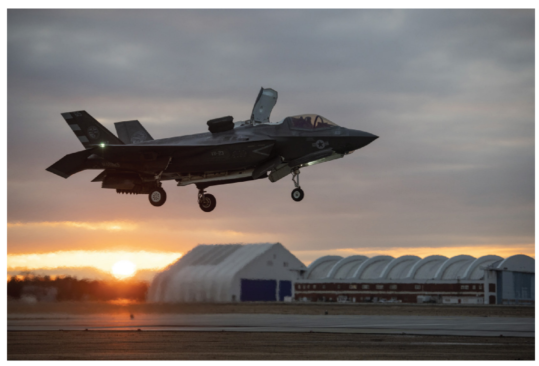
Figure 2: An F-35B Performing a Vertical Landing at Naval Air Station Patuxent

Economic development. This topic covers domestic and international development initiatives, including loans and grants; construction and disaster relief; employment in a changing economy; economic sanctions; small businesses; and trade enforcement. For example, in 2019, we recommended that Congress consider legislation establishing permanent statutory authority for a disaster assistance program administered by the Department of Housing and Urban Development—or another agency—that responds to unmet needs in a timely manner (GAO-19-232). Congressional action in response to this matter could provide a consistent framework for administering funds for unmet needs and thereby reduce lags in accessing funding requirements that may vary for each disaster. It could also reduce difficulties coordinating with multiple federal agencies. Action on this matter is important because extreme weather and climate-related events are expected to become more frequent and intense.