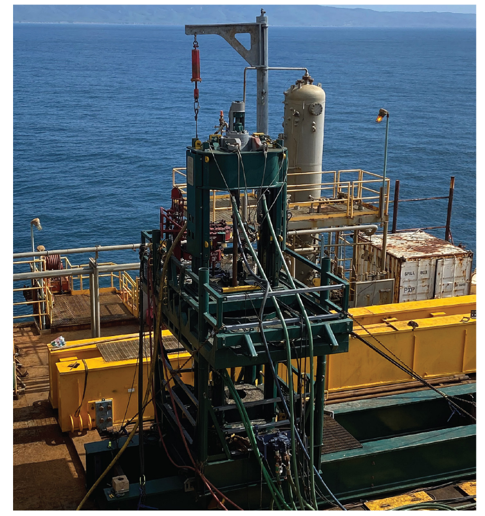
Figure 4: Offshore Well Plugging Operations in the Pacific Region

The oldest open matter is more than 20 years old (GAO-02-47T). In 2001, we recommended that Congress consider commissioning the National Academy of Sciences or a blue-ribbon panel to conduct a detailed analysis of alternative organizational food safety structures and report the results of such an analysis to Congress. This action is needed because the safety and quality of the U.S. food supply, both domestic and imported, are governed by at least 30 federal laws that are collectively administered by 15 federal agencies. The fragmented nature of the federal food safety oversight system has caused inconsistent oversight, ineffective coordination, and inefficient use of resources. This matter remains highly relevant to addressing one of the issues on our High-Risk List—Improving Oversight of Food Safety. The issue is also an example of fragmentation that we track in our duplication and cost savings body of work.