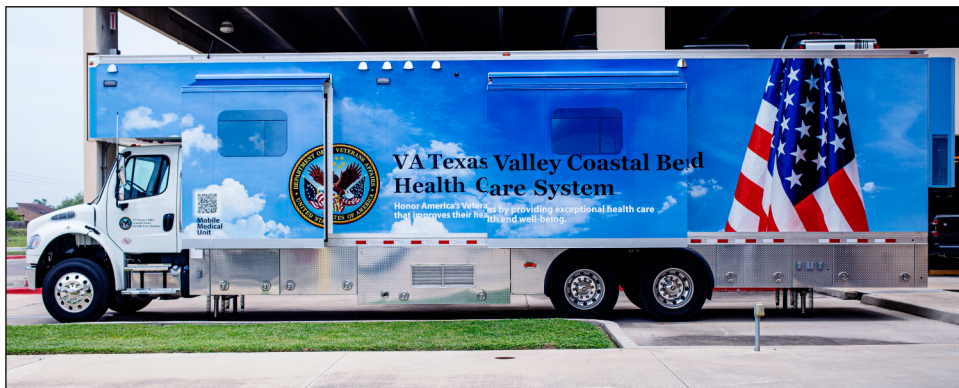
Figure 3: Example of a Department of Veterans Affairs Mobile Medical Unit in Texas

Source: Department of Veterans Affairs. | GAO-24-107559