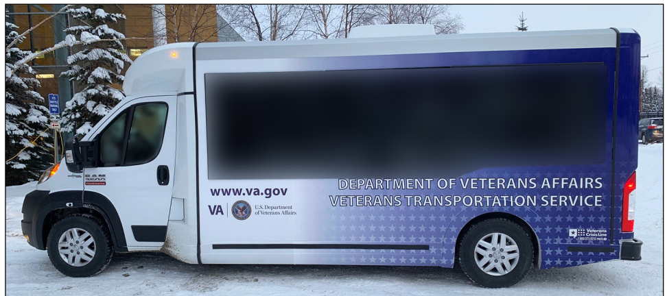
Figure 2: Example of Department of Veterans Affairs Veterans Transportation Service Van in Alaska

GAO-24-107559