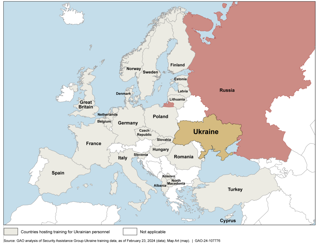
Figure 3: Map of Host Countries Where Ukraine Military Training Has Taken Place, as of February 23, 2024