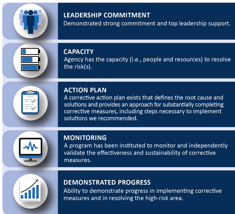
Figure 1: Criteria Essential to Addressing GAO High-Risk Areas

five criteria: leadership commitment, capacity, an action plan, monitoring, and demonstrated progress (see fig. 1). 9