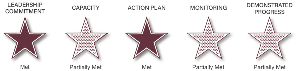
Figure 3: Status of the Bureau of Indian Education’s Progress in Addressing High-Risk Management Weaknesses, as of April 2023